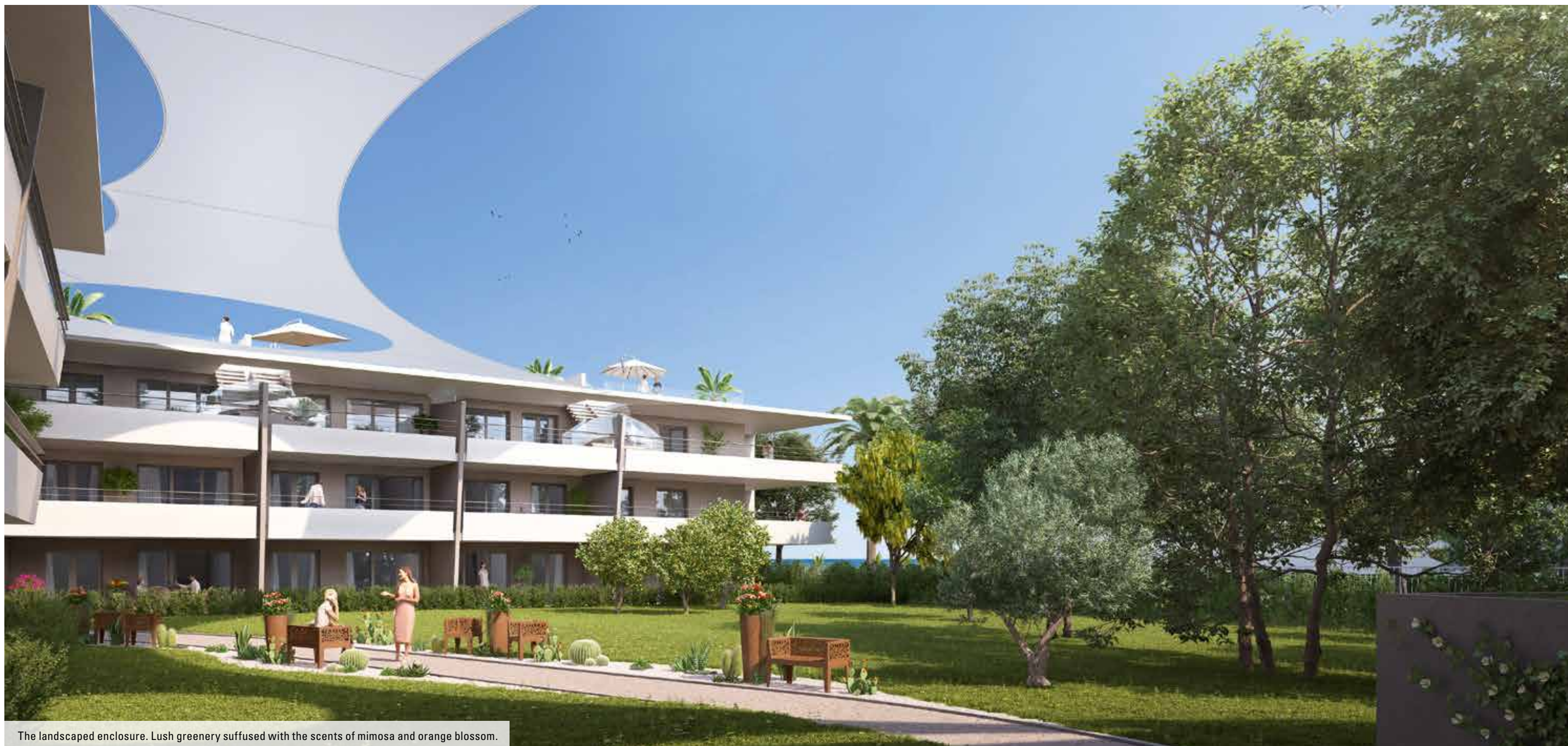
The landscaped enclosure. Lush greenery suffused with the scents of mimosa and orange blossom.