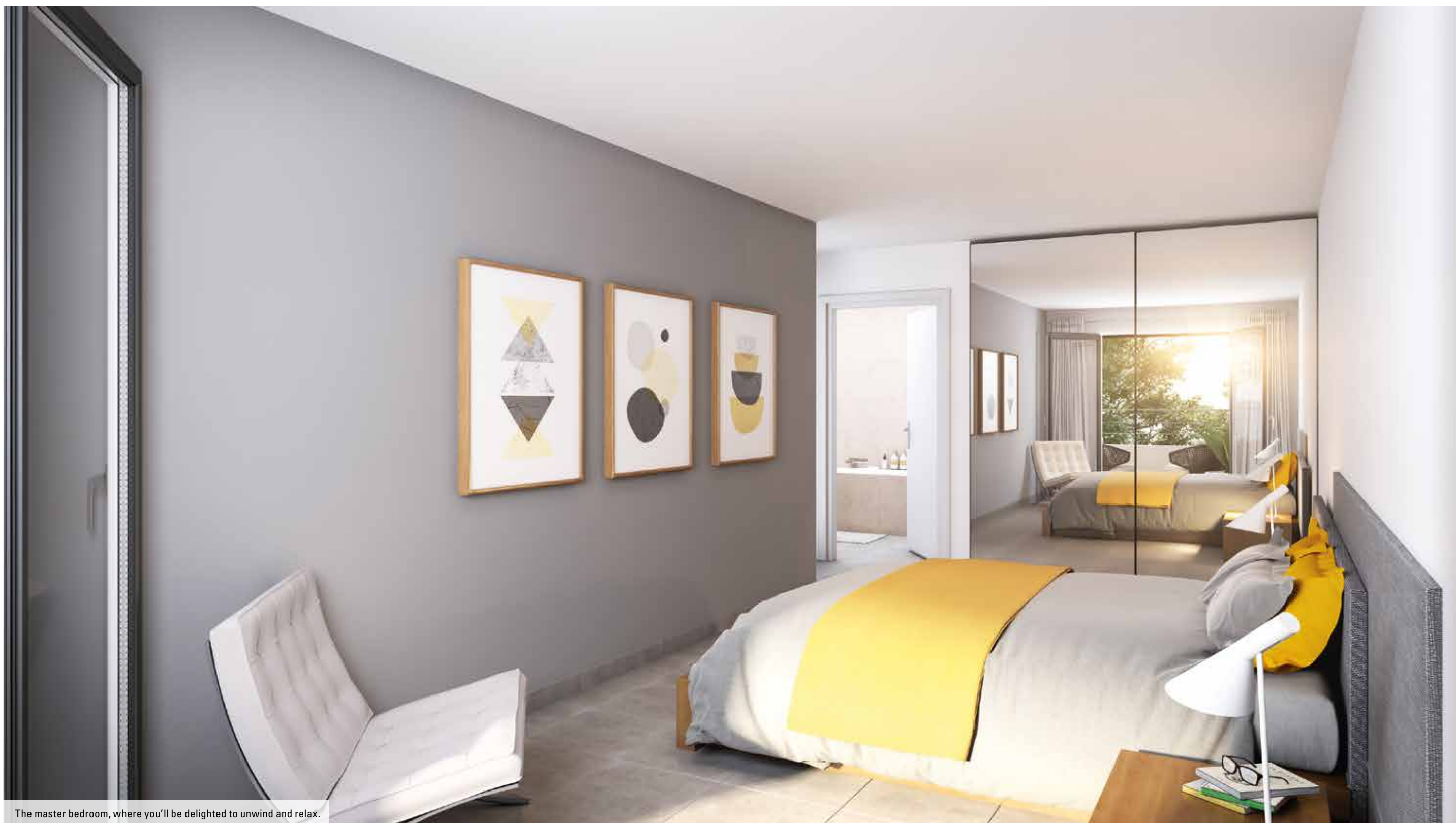
The master bedroom, where you'll be delighted to unwind and relax.