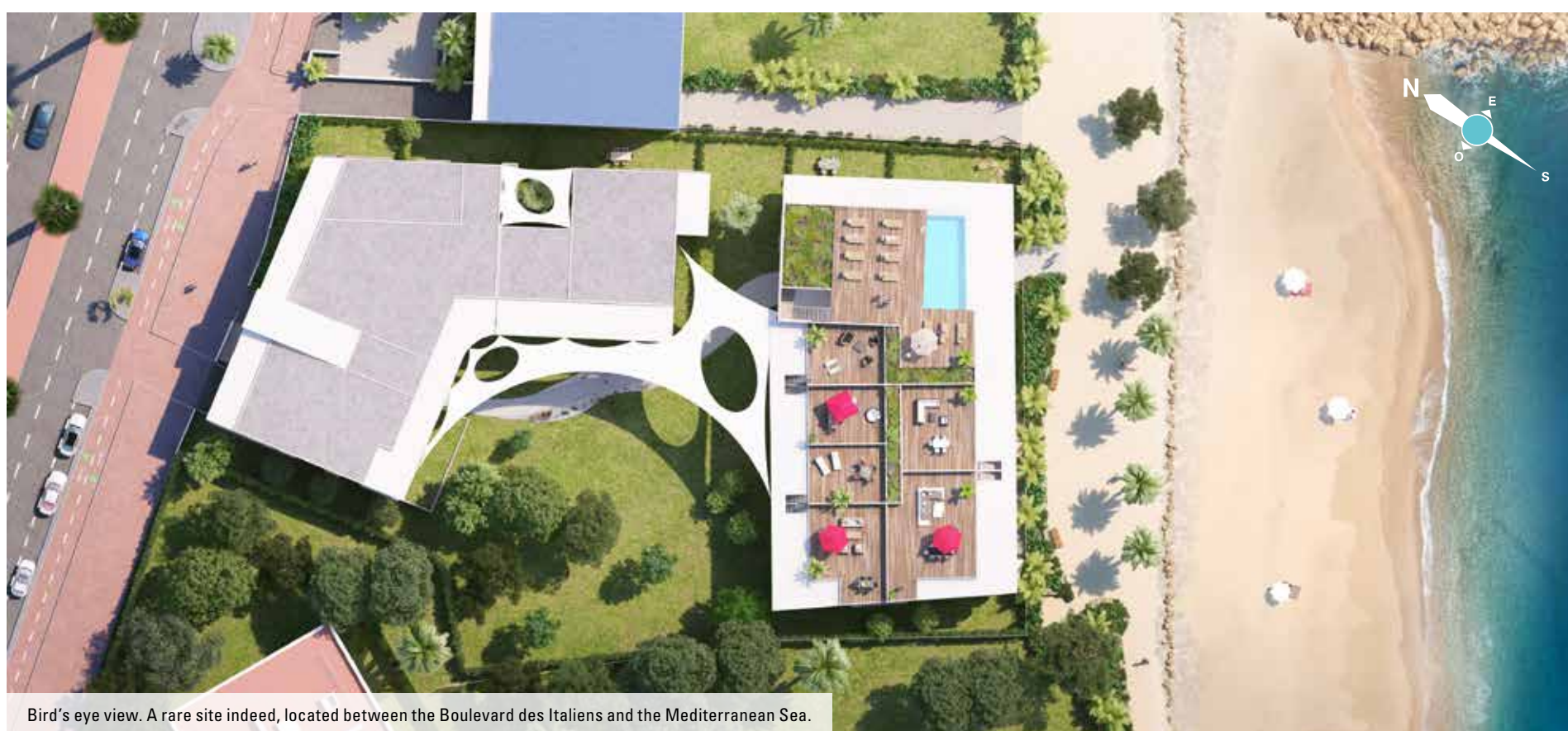
Bird's eye view. A rare site indeed, located between the Boulevard des Italiens and the Mediterranean Sea.