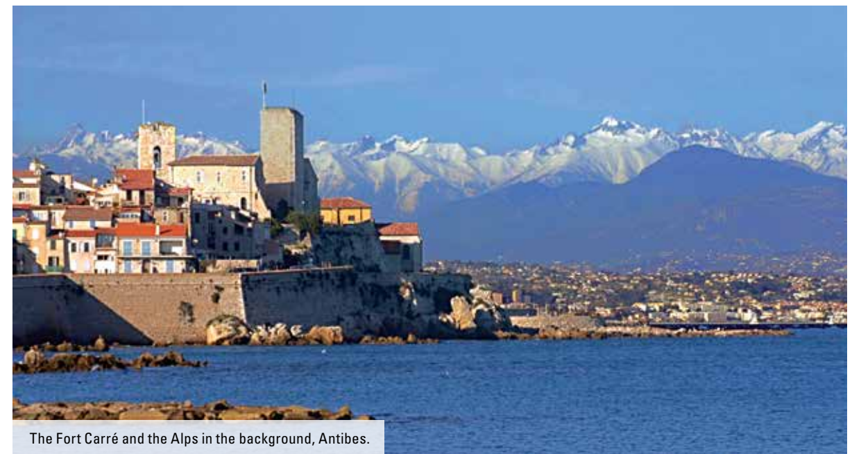
The Fort Carré and the Alps in the background, Antibes.