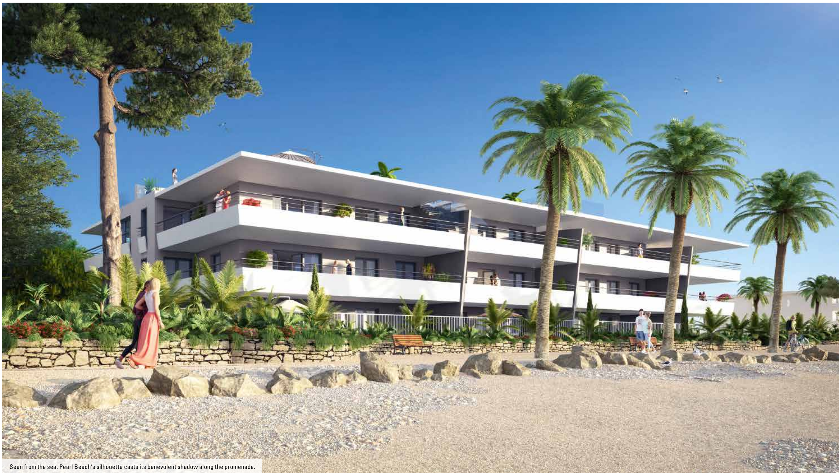
Seen from the sea, Pearl Beach's silhouette casts its benevolent shadow along the promenade.