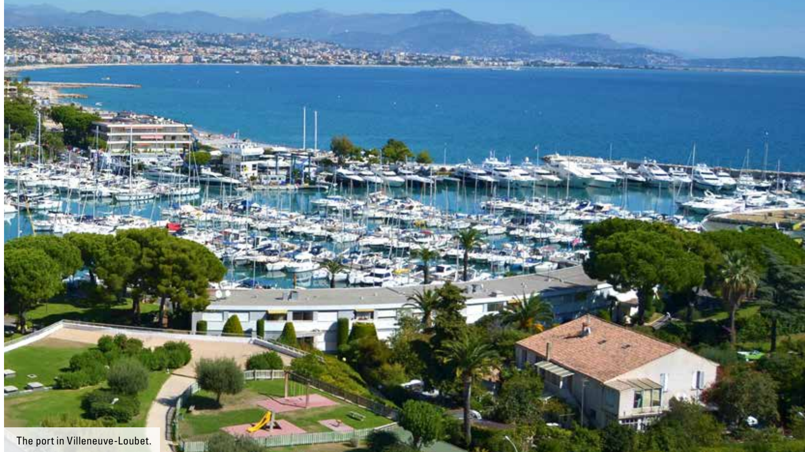
The port in Villeneuve-Loubet.

Within just a few steps of all the services on offer in Villeneuve-Loubet and the lively hustle and bustle of the French Riviera... Pearl Beach is all of this and more.