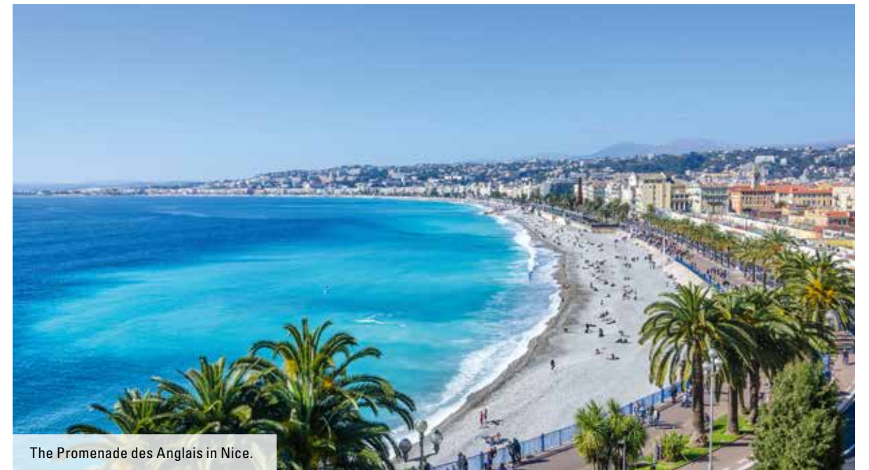
The Promenade des Anglais in Nice.