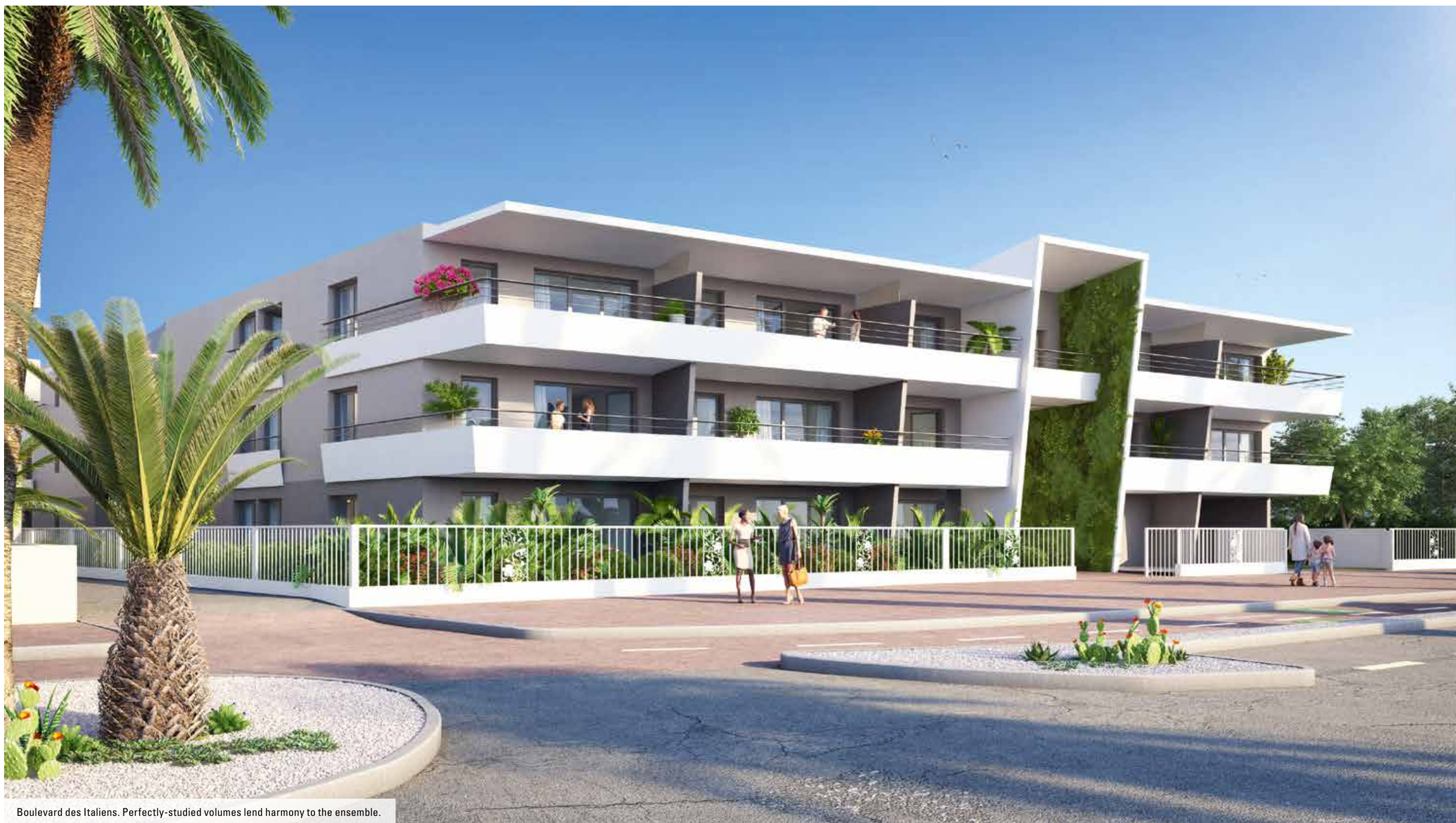
Boulevard des Italiens. Perfectly-studied volumes lend harmony to the ensemble.